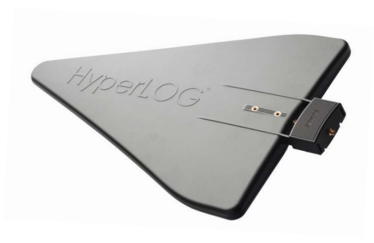
The BPSG as Field-Strength-Generator up to 3V/m (1m distance), available as "DFG 4060"

The BPSG can also be connected to an external reference clock and thus be synchronized with a measuring system. In addition, this way even higher accuracy can be achieved (Using an OCXO, Rubidium timebase etc.).