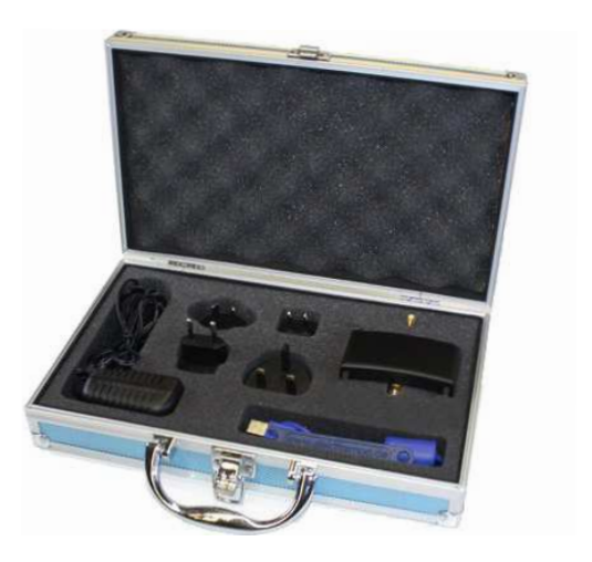
Scope of delivery: transport case, international12V power supply, USB Cable, SMA/SMA (f/f) Adapter, SMA Tool, PC Software, Calibration data

With the very compact dimensions of just 80x50x30 mm and weighing only 150 grams, the BPSG series is predestined for mobile use and fits in every pocket. The compact form factor makes the BPSG the world's smallest battery-powered RF generator up to 6GHz.