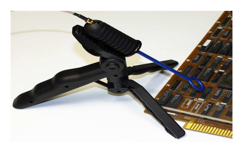
Pinpointing interference sources on a circuit board

For example, should an interference source exceed an official EMC limit by 10dB, our kit can easily verify if a certain countermeasure succeeds in making the circuitry conforming again. This is another situation where the EMC kit can eliminate the need for expensive and time-consuming measurements in EMC laboratories.